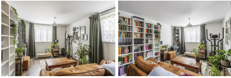
Kitchen 17'11" x 5'10" (5.47 x 1.78)