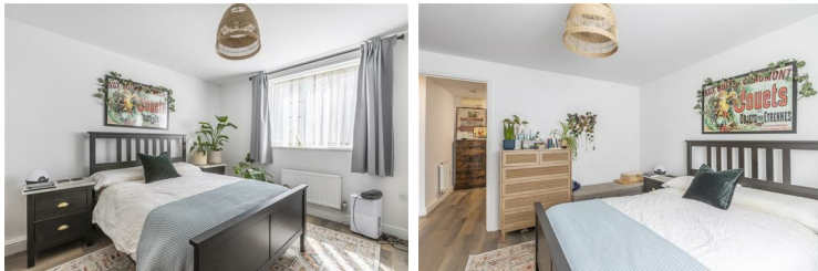
Bedroom 2 12'1" x 7'2" (3.70 x 2.20)